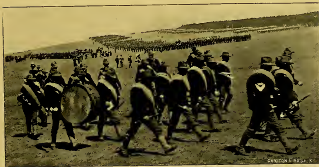
THE TWENTIETH KANSAS BAND.